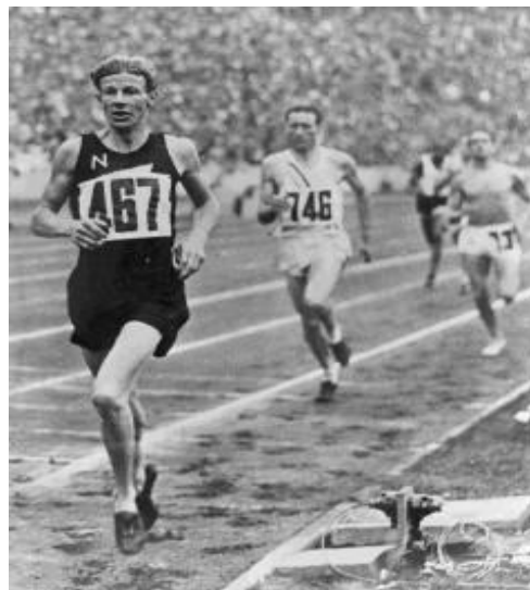
"The most beautifully executed race of my career" Jack Lovelock wins gold at Berlin. Behind him are his two great rivals, the American Glenn Cunningham, the world mile record-holder, and the Italian Luigi Beccali, the reigning Olympic champion.

Toilet and changing facilities: These are available under the grandstand, and under the Hill City University Athletic Clubrooms.