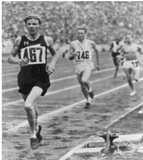
"The most beautifully executed race of my career" Jack Lovelock wins gold at Berlin. Behind him are his two great rivals, the American Glenn Cunningham, the world mile record-holder, and the Italian Luigi Beccali, the reigning Olympic champion.

Toilet and changing facilities: These are available beside the grandstand, and under the Hill City University Athletic Clubrooms.